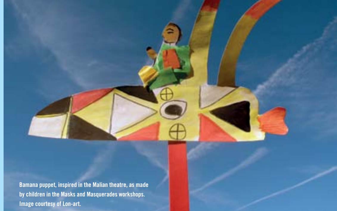
Bamana puppet, inspired in the Malian theatre, as made by children in the Masks and Masquerades workshops.

Tower Hamlets Council cannot take responsibility for any of the events mentioned in this brochure or for any incidents that may take place. Please take care of all personal belongings. It is advisable to contact the venue before you leave to check disabled access. Brochure information correct at the time of going to press. For further information on transport links go to: www.tfl.gov.uk or call 020 7222 1234