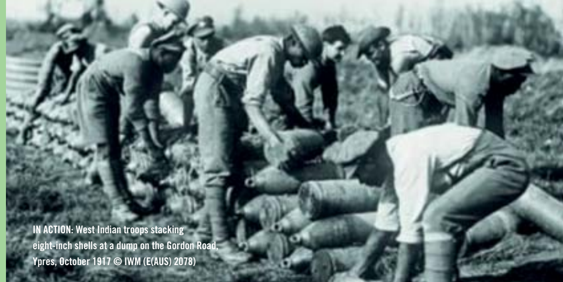
IN ACTION: West Indian troops stacking eight-inch shells at a dump on the Gordon Road, Ypres, October 1917

Lionel died in 1929 from the after-effects of war-time gassing. Lionel's story is typical of many Black colonials who came to the aid of the 'Mother Country' during the First World War.