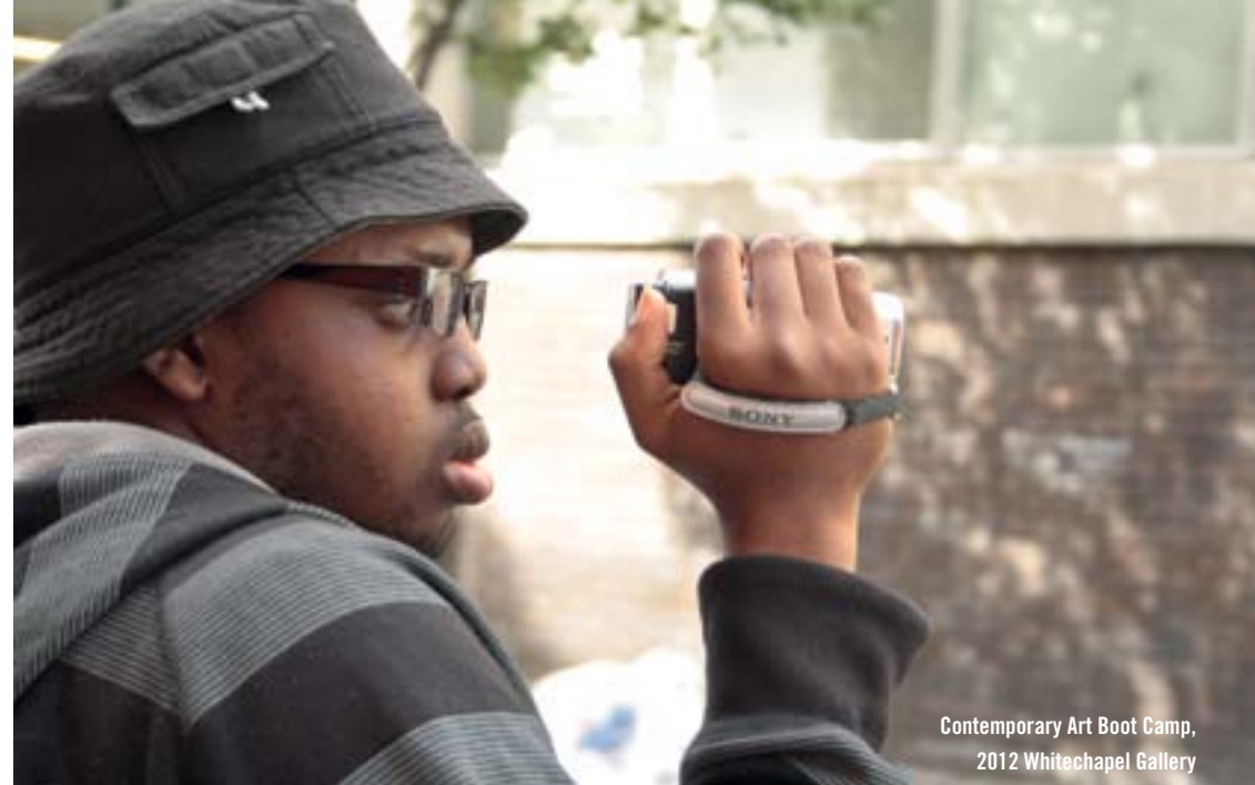
Contemporary Art Boot Camp, 2012 Whitechapel Gallery