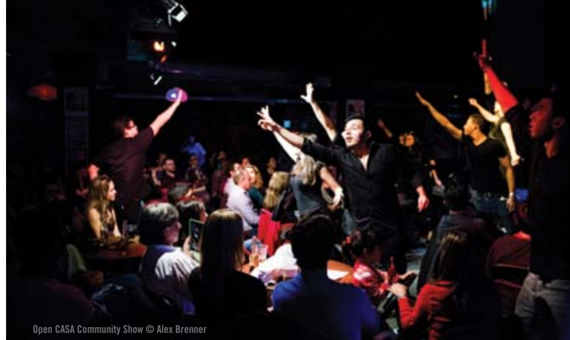
Open CASA Community Show