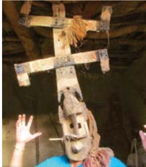
Dogon Mask

'African Masks and Masquerades' is an event during which we will invite families and communities in Tower Hamlets to embrace Africa from an artistic and cultural perspective. Join us for a full day of African masks, myths, art and dance!