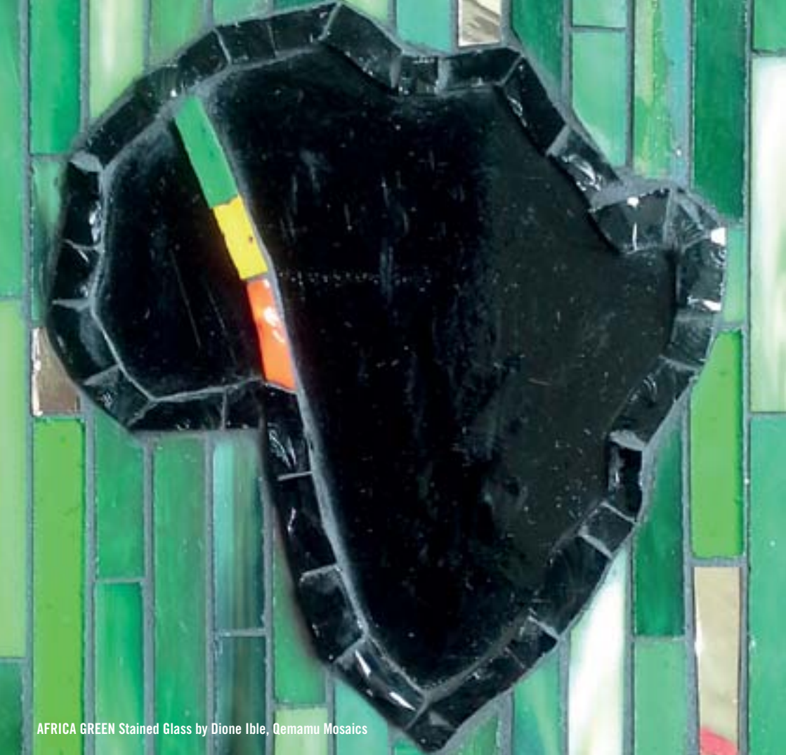
AFRICA GREEN Stained Glass by Dione Ible, Qemamu Mosaics